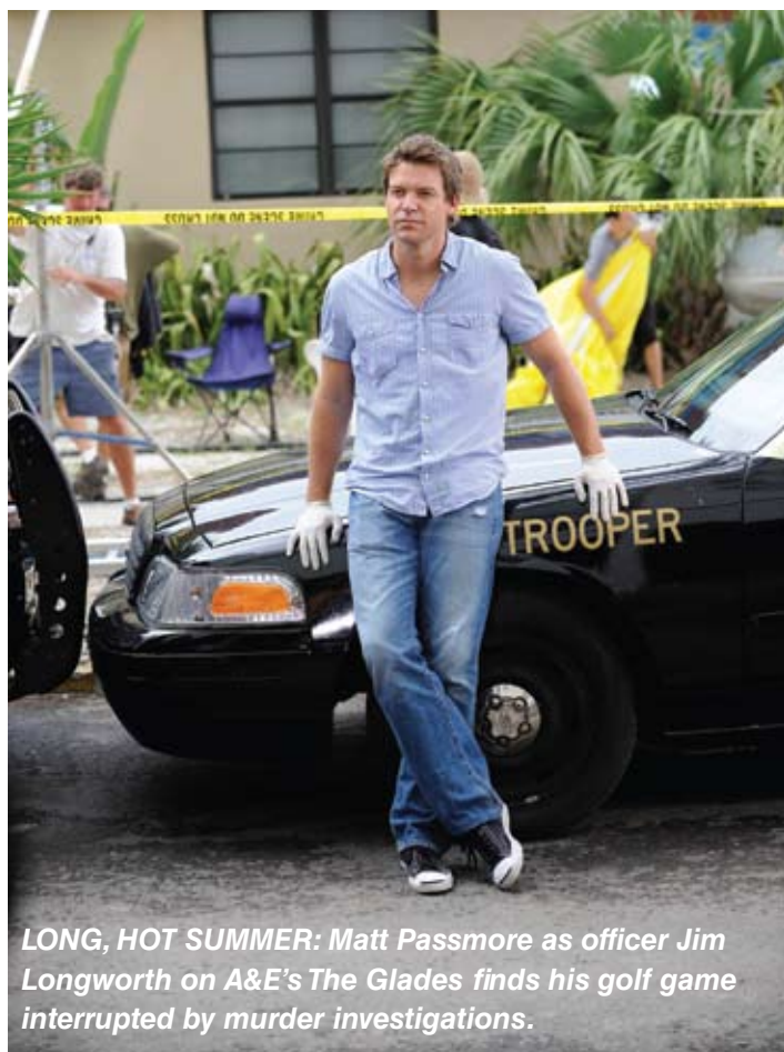
LONG, HOT SUMMER: Matt Passmore as officer Jim Longworth on A&E's The Glades finds his golf game interrupted by murder investigations.

We usually balk when ads open where a Website is supposed to be. Yet A&E's takeover of nytimes.com to tout "The Fugitive Chronicles" was so cleverly done, with videos of a prisoner in orange jumpsuit running across the page and being chased by police and a helicopter, that we had to applaud.